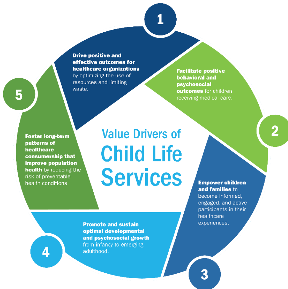
Figure 2. The Five Value Drivers of Child Life Services.

in the face of medical experiences 77-79 and attenuate the negative physical and psychosocial effects of stress, loss, and grief - including stroke, heart attack and high blood pressure in adulthood 80,81 - thereby cultivating health-promoting behaviors 81 throughout the lifespan.