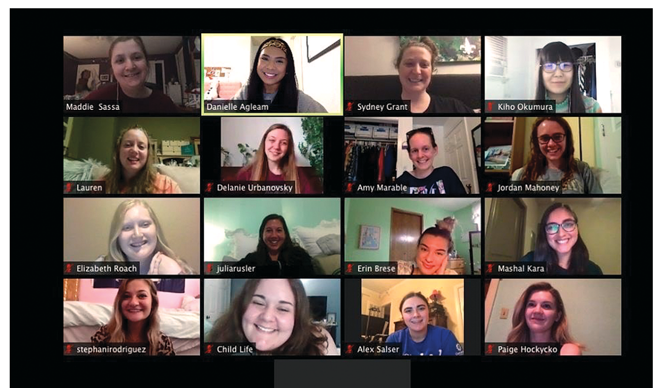
Screen shot of a typical Child Life Journals and Journeys meeting

Our current operations are thus: Members use a sign-up sheet maintained in Google Docs to determine who will choose the article each month. The link to the article is shared in the GroupMe calendar and participants are asked to read it prior to the next meeting. On the last Thursday of every month, we have a Zoom video conference meeting to discuss our thoughts, perspectives, and ideas on what we have read. The beginning of the Zoom session is an introduction of the article by the member who selected it; then we use the "breakouts" feature in Zoom to analyze the article in small groups of four to five people so that everybody can have a chance to speak and be heard. After 30 minutes of small group discussion, we rejoin the main Zoom session and share what we discussed together. As the facilitator of the meeting, I pop into the breakout groups and assist with adding probing questions and listen for key points to bring to the full group once we reconvene.