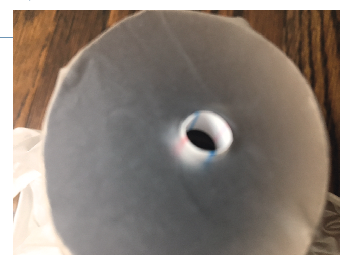
Figure 4 Step 10