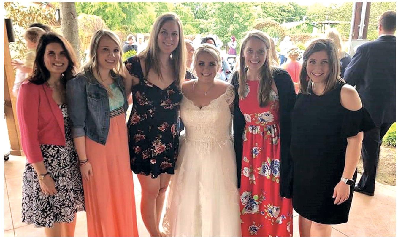
Me and my previous child life team on my wedding day

voked or they are experiencing feelings of threat. What does a snapping turtle have to do with this, you ask? I remember a moment when our pediatric social worker asked me about a visit I had facilitated with one of our patients. I was quick to defend my intervention and validate how it was appropriate, rather than hearing what she was asking and giving her what a colleague of mine calls 'generous assumptions.' Reflecting on that situation, I believe she was trying to express concern for me and the late hours I was working, rather than being critical of me working late to meet a family's needs. Another interaction I remember is a staff meeting where we were having a team debriefing. There was a lot of built-up tension among the team, and it was an opportunity for us to express our feelings in a safe environment with a mediator. I do not remember what was said exactly, but what I do remember is what happened when I finally spoke up. Over a year of unexpressed anger and emotions exploded out of my mouth as tears ran down my face, and I told the team I was done. I revealed that I had an in-person interview for another job later that week, and no matter what happened, I was leaving. This was not my finest moment, professionally or personally. This was not me at all, and I am still mortified by it over five years later. Becoming a snapping turtle was my big, red flag moment of realization. I was done. I was burnt out. I could not take it anymore, and it was time to step away.