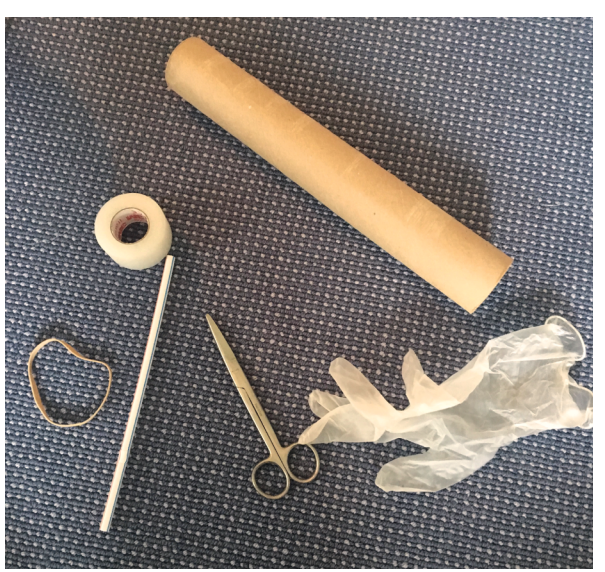
Figure 1 Materials needed.

Although the most common age for ear tube placement is one to three years, this preparation is designed for an older child (four to eight years old). Many older children also get tube placement (either initial or repeat), and this loose parts project is intended to scaffold and build on their existing knowledge for improved understanding and coping and to promote mastery. In instances when this is a repeat procedure, many children may not remember the initial placement or procedure and may fear bodily harm and loss of control (Children's Hospital of Philadelphia, 2015; Rollins, Bolig, & Mahan, 2018).