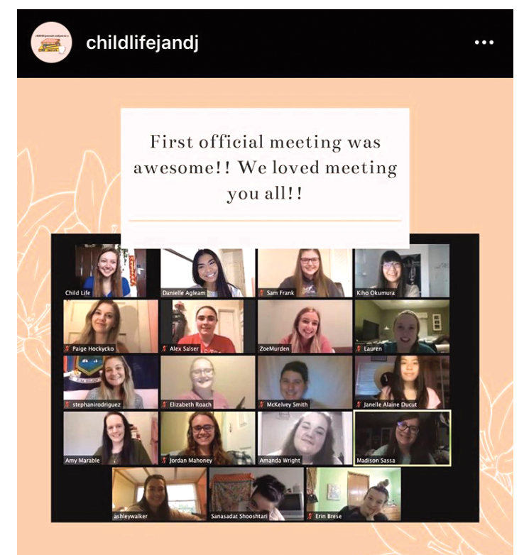
First official meeting of Child Life Journals and Journeys

s a child life student based in Beijing, China, my quarantine experience began two months earlier than the rest of my child life peers in North America. From late January 2020 until May 1, 2020, heavy restrictions were enforced by police across the city of Beijing due to the spread of COVID-19. While the isolation from friends, family, and activities was challenging, I struggled most with the progress towards my career goals being paused. I knew that in North America the rest of my cohort was racking-up precious volunteer hours, while the hospital where I volunteer was on government lockdown. I missed seeing those children and the feeling you get when you know you are making a difference.