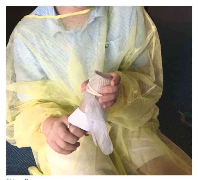
Figure 2 Step 6